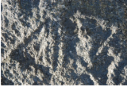
Triangles on stones