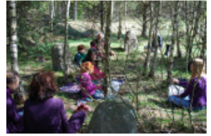
Deep in the heart of Babi Dol

Interestingly, when we returned late that evening to our house, we all felt the same. Though we were totally impressed with Gdansk and tempted to spend a second day there as originally planned, all of us felt the same. We wanted to go to another stone circle! Orion had told us that there was a third stone circle site, optional. We felt drawn to the stones, even more than the shops!