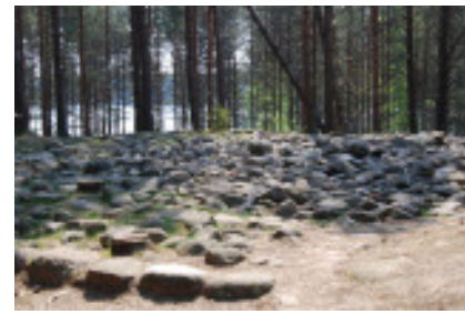
Guardian Stone Circle

The energy or spirit of the stones spoke: