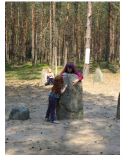
Right: Listening to the stone breathe at Wiesory

on this place, it would look like constellations.” When we read more about Odry site we saw that, indeed, it was said to reflect the form of constellations.