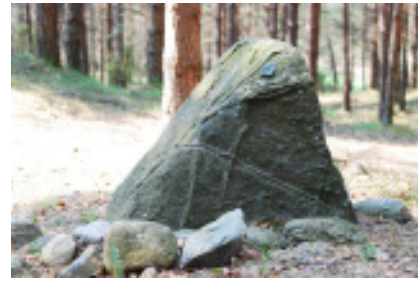
Pyramid stone in Wiesory

April 28, 2011 Orion--during activation Yes, Yes. Of course. It appears that this circle called by the name of 'Offering,' has been created in a way which seems far different from other stone circles. The activation need be done at the highest point.